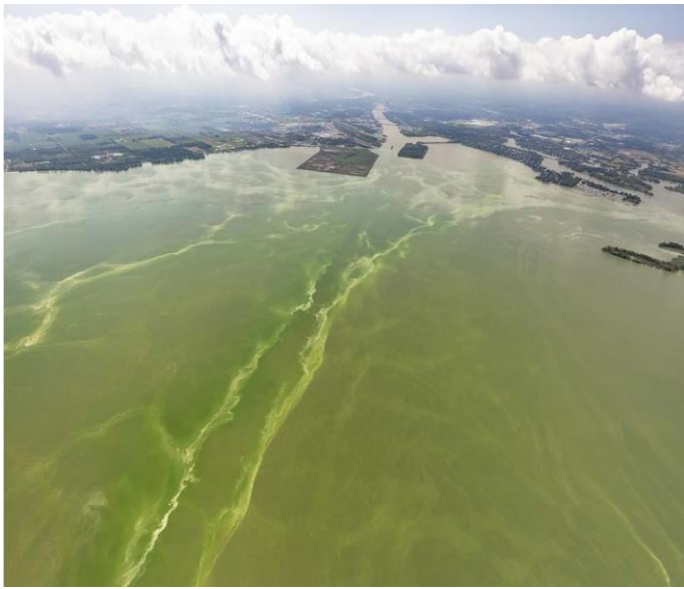
Predicted Bloom Severity